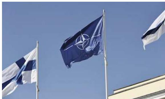
Finnish and NATO flags flutter at the courtyard of the Foreign Ministry in Helsinki.

NATO Secretary General Jens Stoltenberg first welcomed Finnish Foreign Minister Pekka Haavisto, who deposited Finland's instrument of accession with the government of the United States – represented by Secretary of State Antony Blinken.